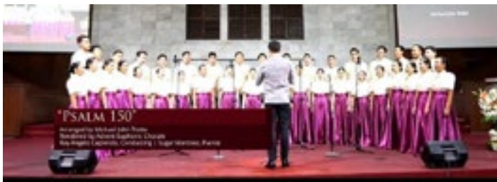
Advent Euphonic Chorale